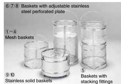
⑥⑦⑧ Baskets with adjustable stainless steel perforated plate ①~④ Mesh baskets ⑨⑩ Stainless solid baskets ⑤ Baskets with stacking fittings