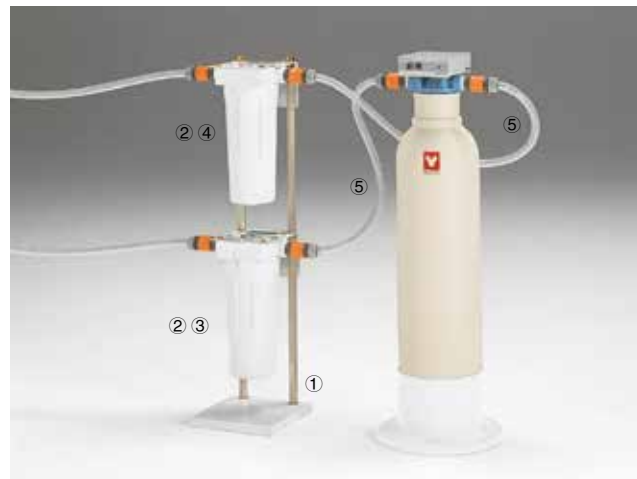
This set includes WL100 + ①Filter stand + ②Filter housing unit (×2sets) + ③Active carbon filter + ④Membrane filter + ⑤Connection unit B

When supplying water to WL100, be sure to open the outlet side of WL100.