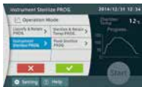
Operation mode selection (instrument sterilization program)