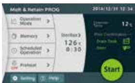
Sterilization parameter settings (instrument sterilization program)