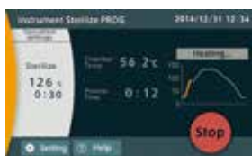
Operating status monitoring (instrument sterilization program)