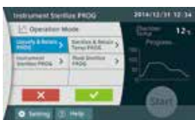
Operation mode selection (melt and retain temp. program)